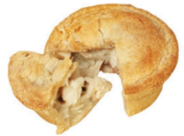
Rabbit Pie Harvested Using an Air Rifle

*provided you are over 18 or over 16 with a firearms licence. Excl. PCP.