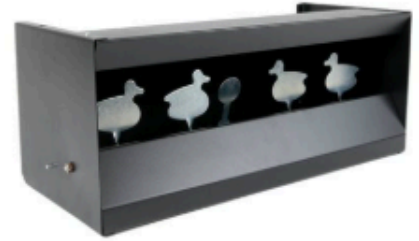
Pellet Trap Target

It's important to ensure your pellets do not go further than your property boundary. This is why it is recommended to have a good, solid back stop. This way, if you miss the target you're aiming at, the pellet is stopped safely within your property. We recommend pellet trap targets (pictured right) or some thick sheets of wood. It is also recommended to be shooting on an angle where your pellet will travel into the ground if the target is missed. We sell a number of targets specifically designed to capture pellets.